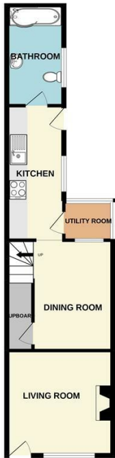
GROUND FLOOR 403 sq.ft. (37.4 sq.m.) approx.